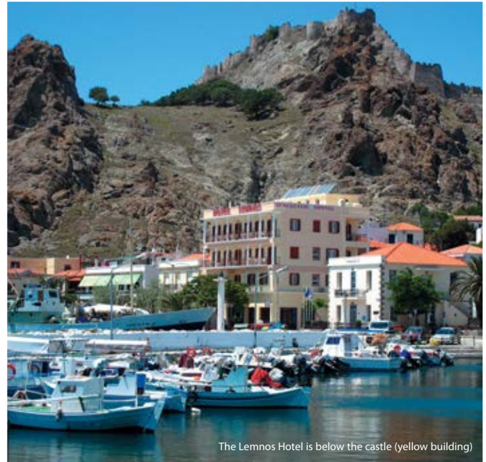
The Lemnos Hotel is below the castle (yellow building)

The Hotel: 2 Star Room Only Air Conditioning Free WiFi (reception area)