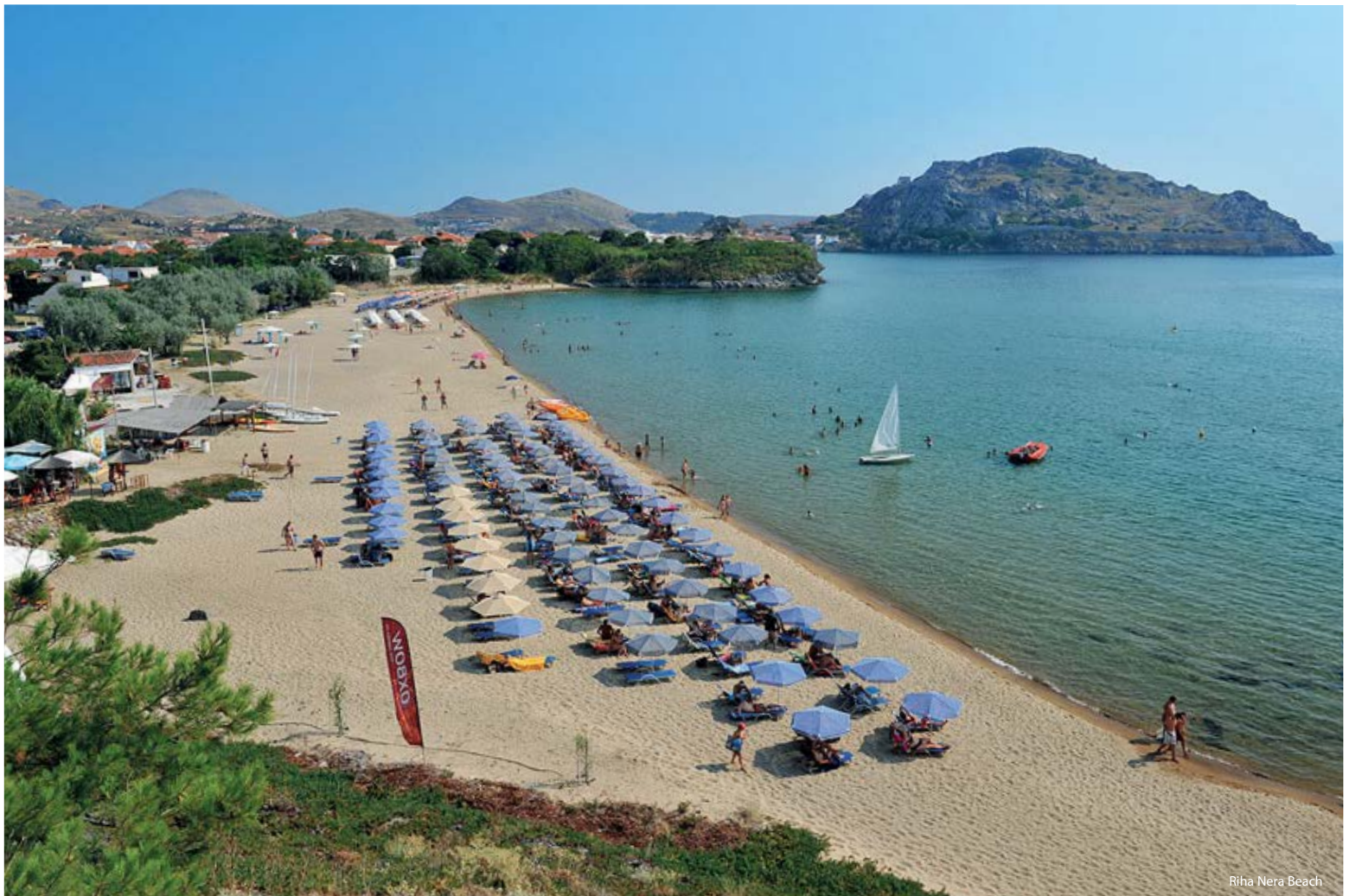
Riha Nera Beach