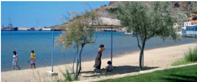
Myrina Town Beach